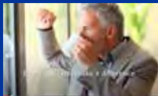
Making a difference