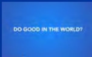
Doing Good in the World