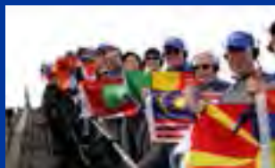
Harbour Bridge Climb